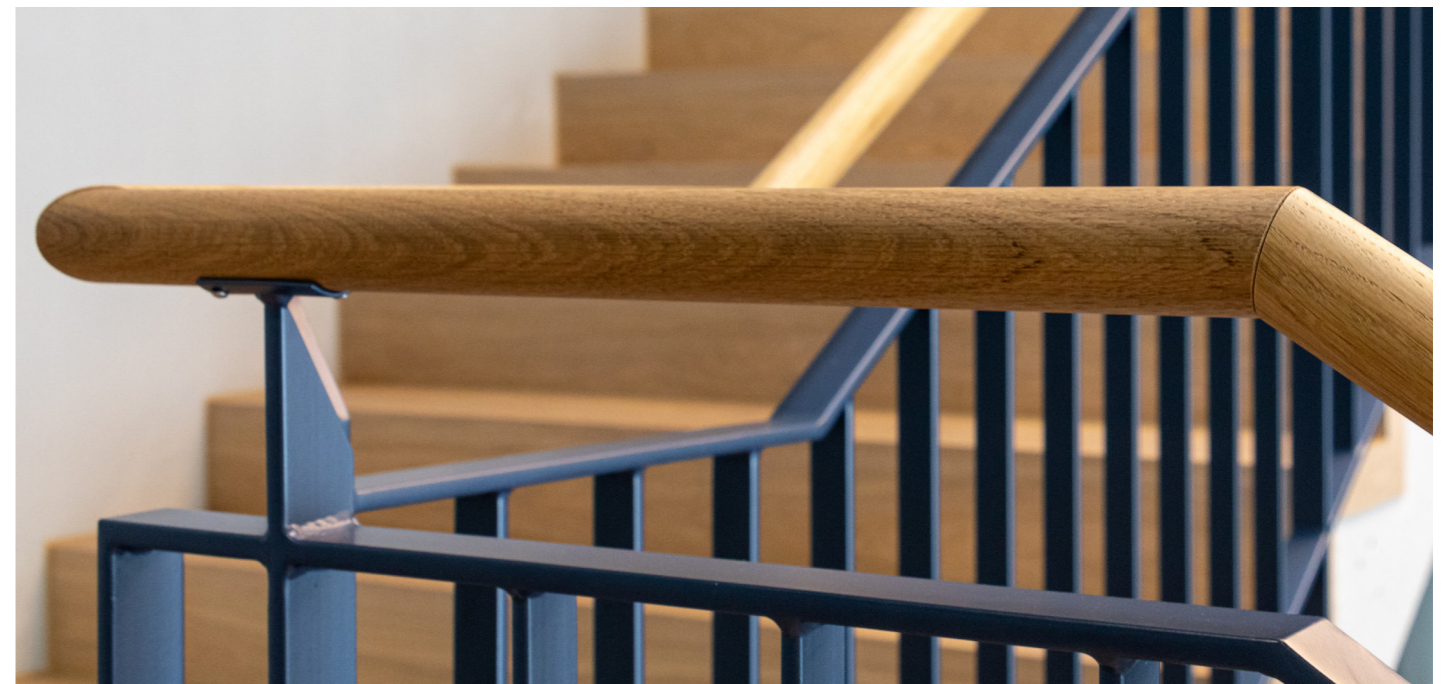
Perfect harmony between materials, forms and colours.