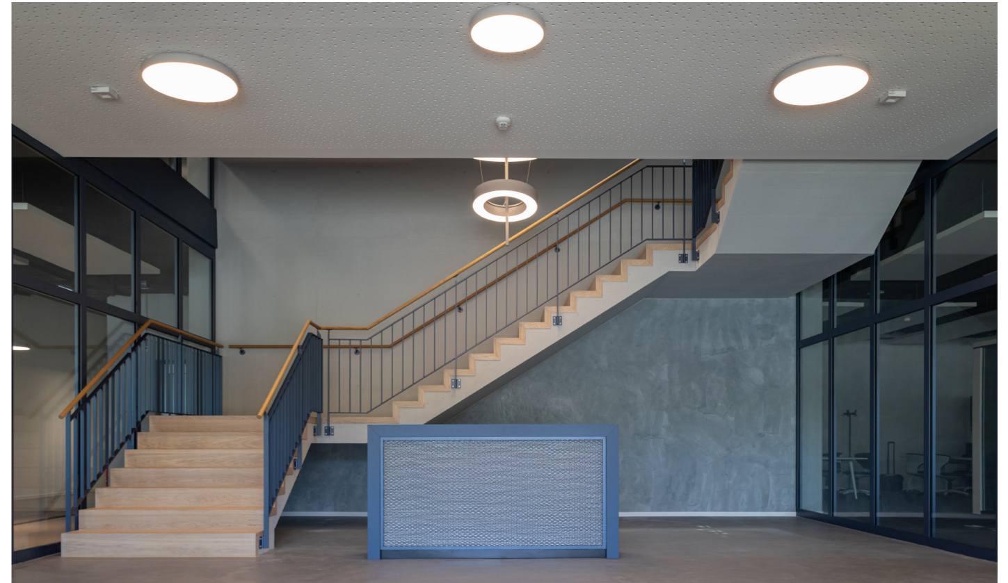
The carefully planned colour scheme continues inside the building.