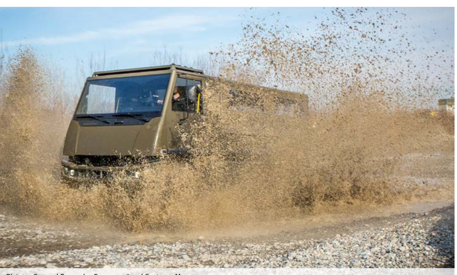
The coating on the Duro has to withstand tough conditions when the vehicle is in operation.

www.kabe-farben.ch KARL BUBENHOFER AG www.kabe-farben.ch KARL BUBENHOFER AG