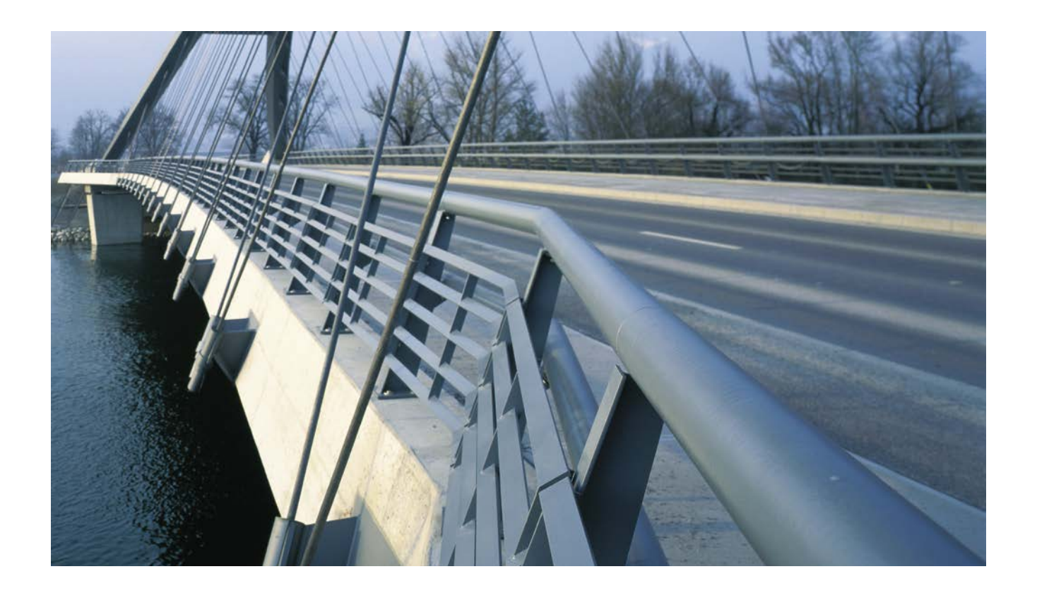
"The GSB certification provides users with increased process safety."