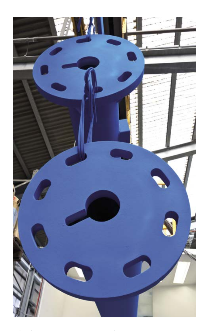
The low temperature powder coating is characterized by smooth design and uniform coating thickness.