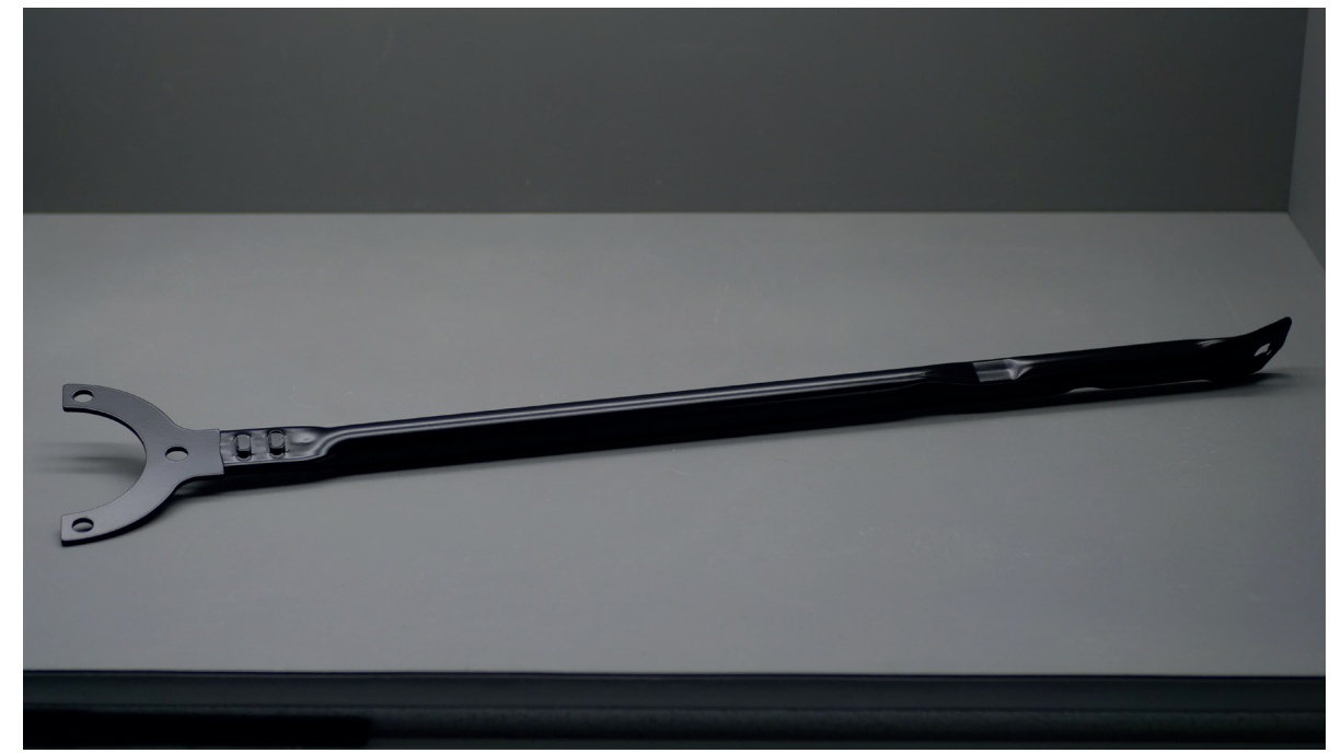
Ultra-thin film coated motor strut, RAL 9005

KABE's UTL powders are used successfully in countless applications, and for HMV, KABE quickly found a powder coating in its portfolio that already met most of the requirements, even in its basic configuration. After customising the formulation with a high binder content, HMV is now able place an exceptionally large number of parts on its hangers. With this excellent hanger utilisation and the high degree of order efficiency for application, HMV now coats up to 15'000 parts of this type every day. "We run with coating thicknesses of 20–40 µm, which is lower than with some conventional liquid coatings. The process has been so successful that the end customer is now installing the product, which was originally conceived as an emergency solution, in series production," reports HMV's Matthias Swoboda.