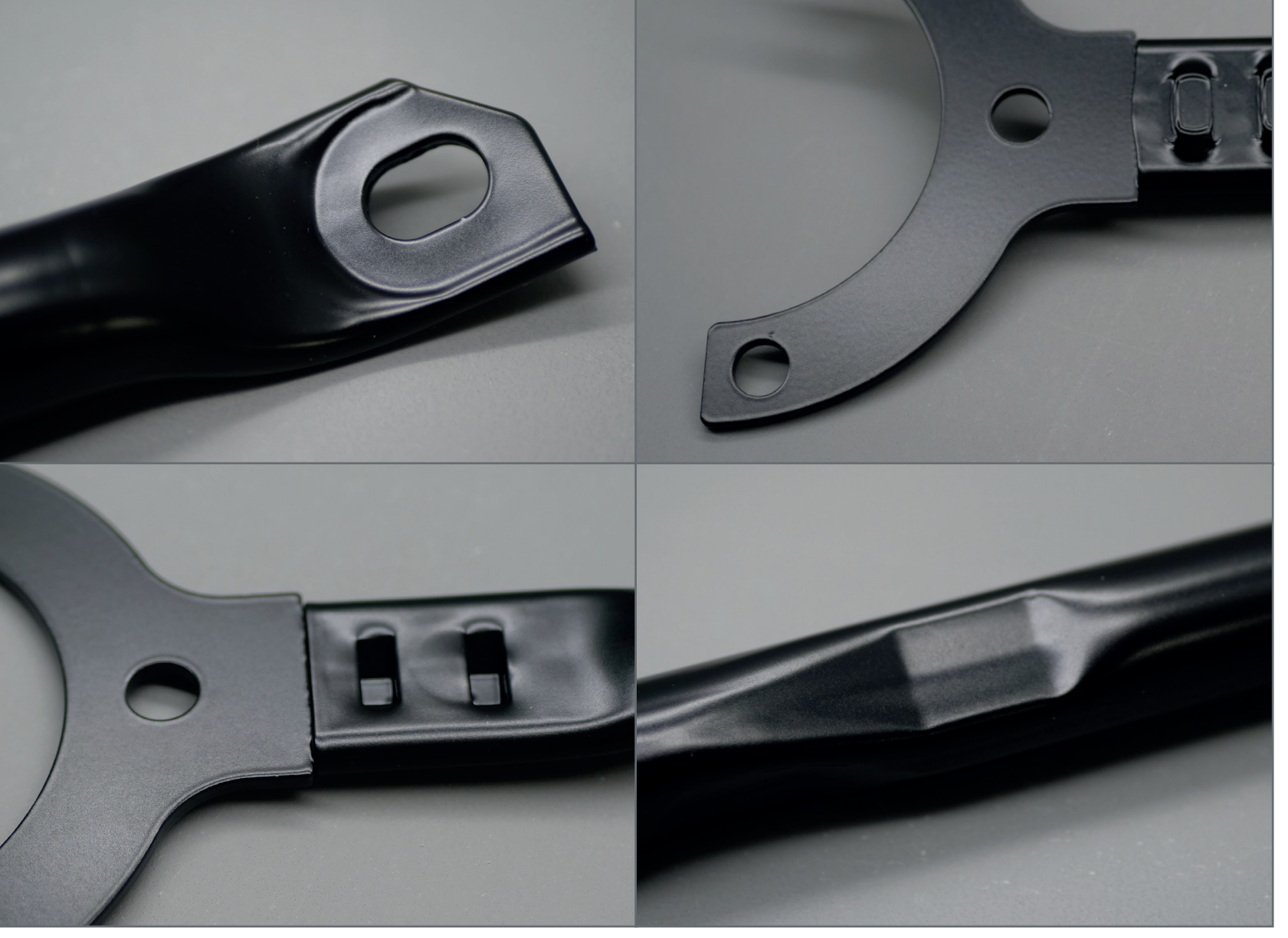
Despite low coating thickness - Excellent flow, very good edge coverage and best corrosion protection properties

Based on the positive experience with powder coating from KABE, HMV suggested to the client that they should switch to ultra-thin-layer powder for this product as well. KABE immediately provided samples for coating trials and, even after a very short test phase, everyone involved was already convinced that they had found the ideal solution. In addition to the dripping problems having been solved, the engine mount's resistance to stone chips was also significantly improved.